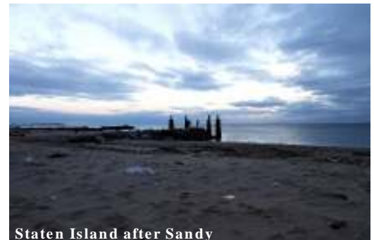
Staten Island after Sandy